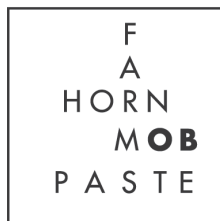
Turn 4: Score 16